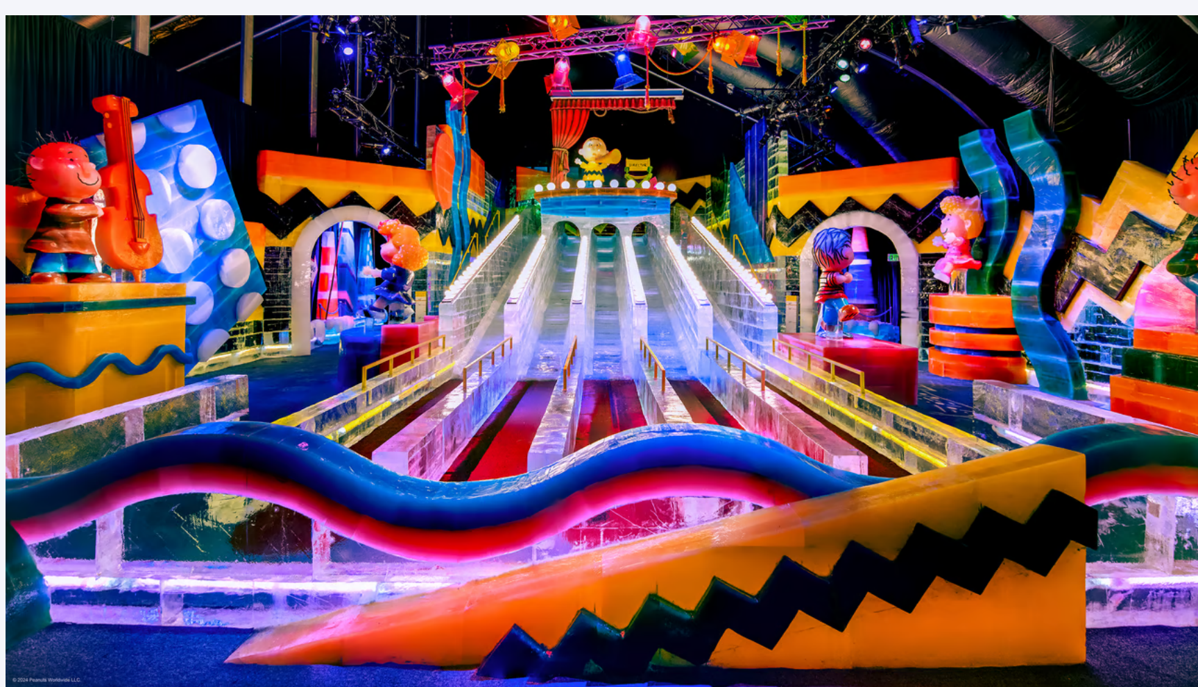
Visit ICE! Charlie Brown at National Harbor and ride down their slide tower.